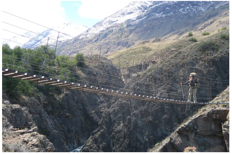
Téa backpacking in Chile, November 2024.